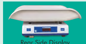
Rear Side Display