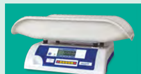
PBY Series (LCD Display)