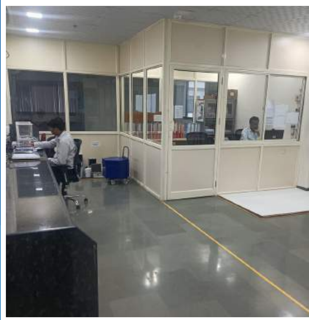
NABL accredited laboratory

✓ ISO 9001:2015 certified Quality Management System