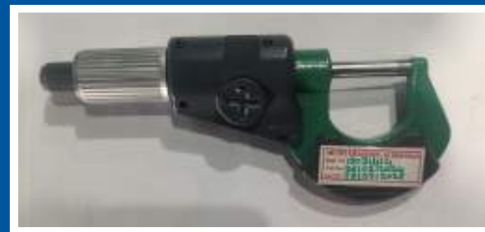
QMS procedure for calibration of testing equipment