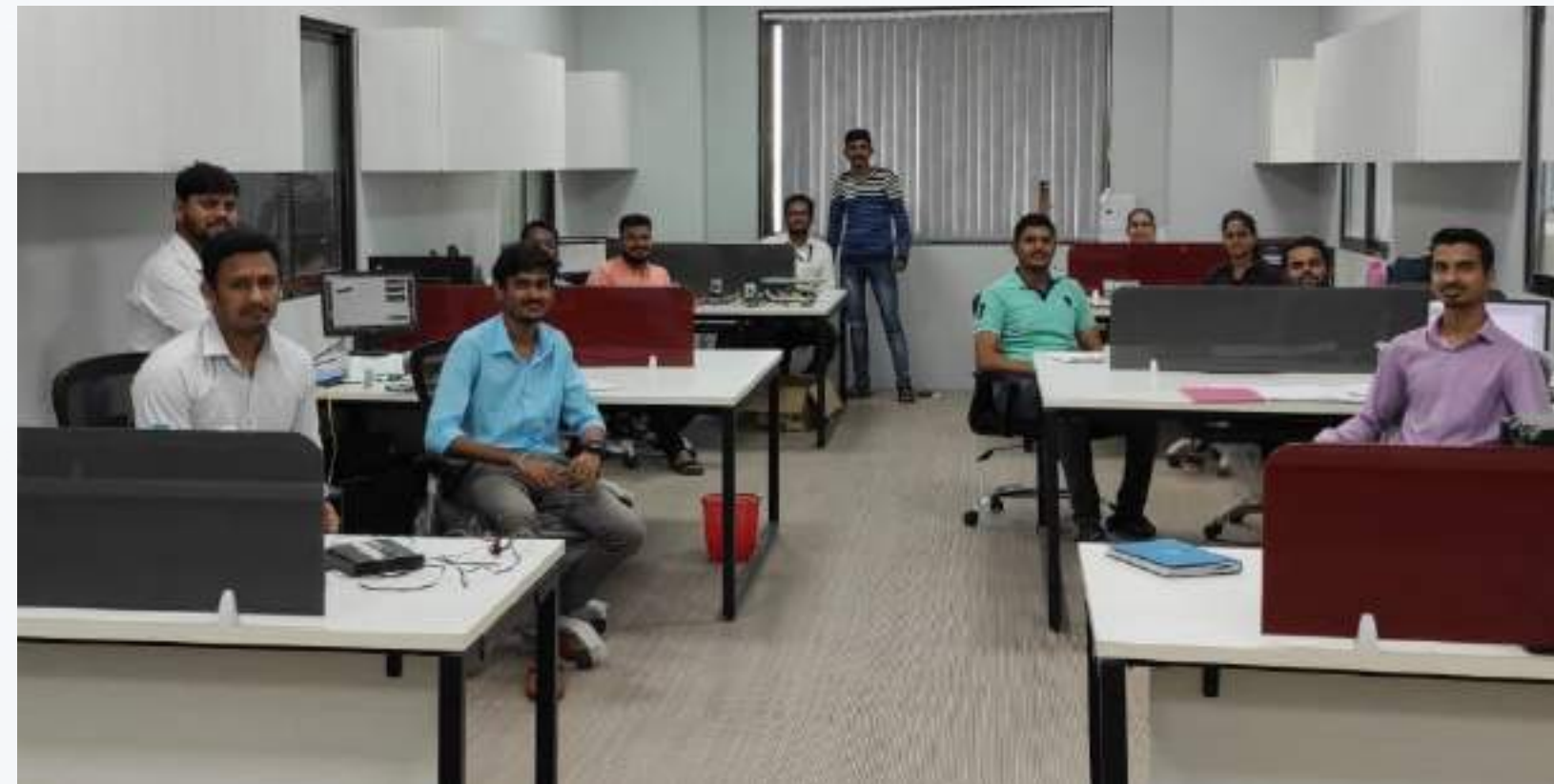
Team of Developers