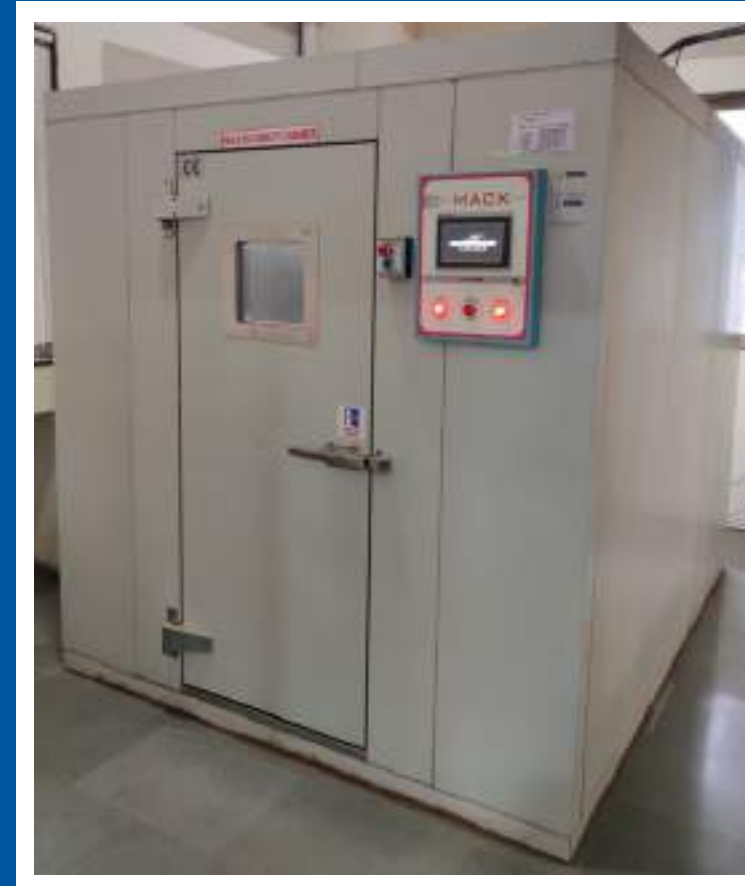
Temperature & Humidity controlled chamber for testing