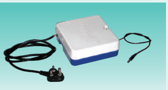
Adaptor Box with Battery