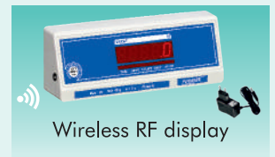
Wireless RF display