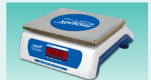
Rear side on machine display