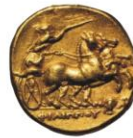
Ancient Olympic Coin depicting Victory, 480 B.C