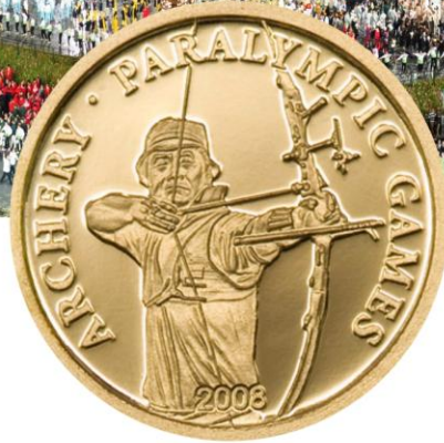
2008-Olympic Gold Coin Mongolian Bank

NITIRAJ ENGINEERS LTD. News Letter VOL- 15 ISSUE - 09 December - 2015