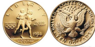
U.S.A - Olympic 1984 Gold Coin of $ 10

The Olympic Games have always been the most esteemed athletic event on our planet. This is one of the greatest gift government to mankind